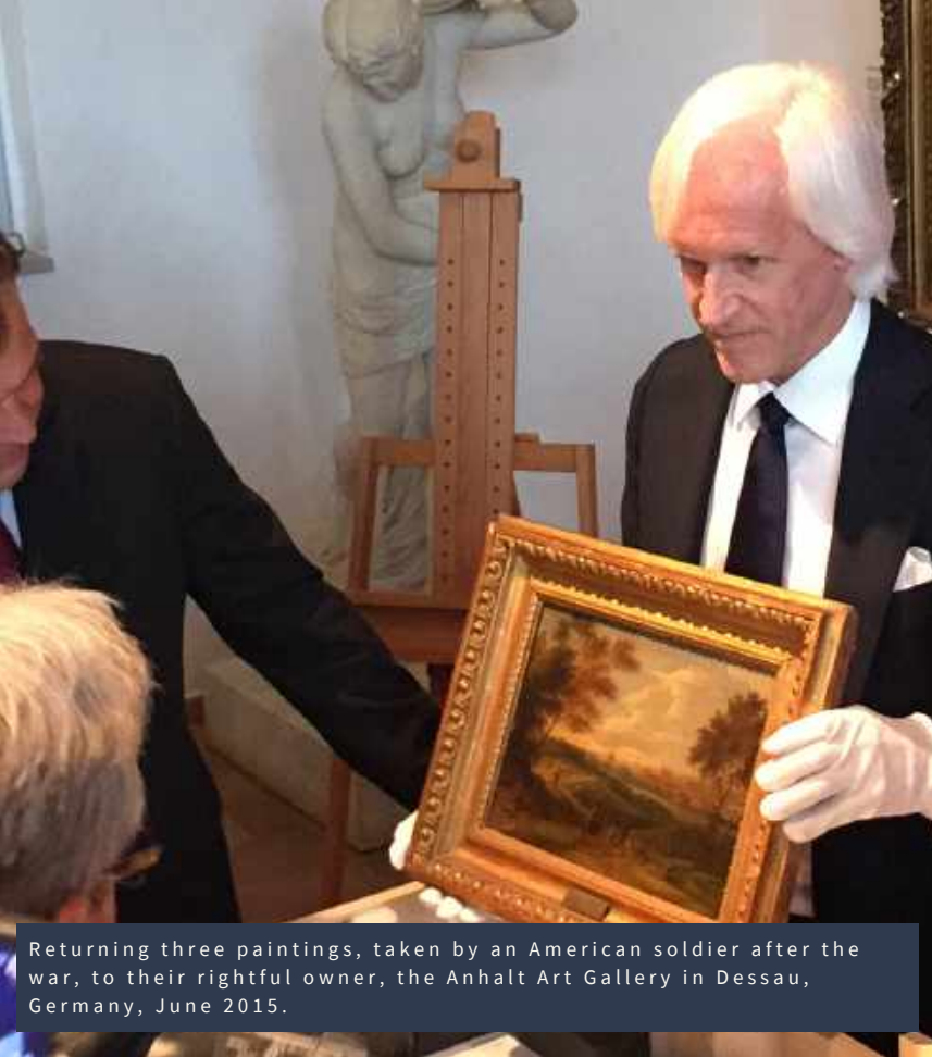
Returning three paintings, taken by an American soldier after the war, to their rightful owner, the Anhalt Art Gallery in Dessau, Germany, June 2015.